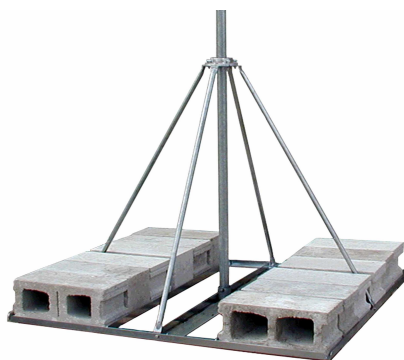
1/4-20 x 1/2" HEX HD BOLT