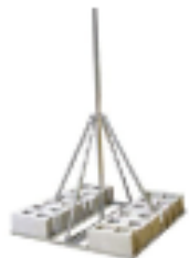
NPRM-3 16 Gauge Steel