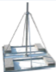
NPRM-2 14 Gauge Steel