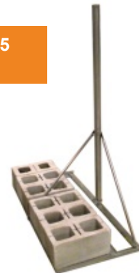
NPRM-1/2-LD-5 (5' mast)